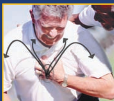
Common places heart attack pain is felt in men.

Pain can be sharp or dull and mild to severe.